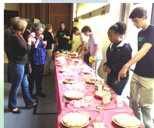
Youth United members serve up pie at the group’s annual pie festival in November.