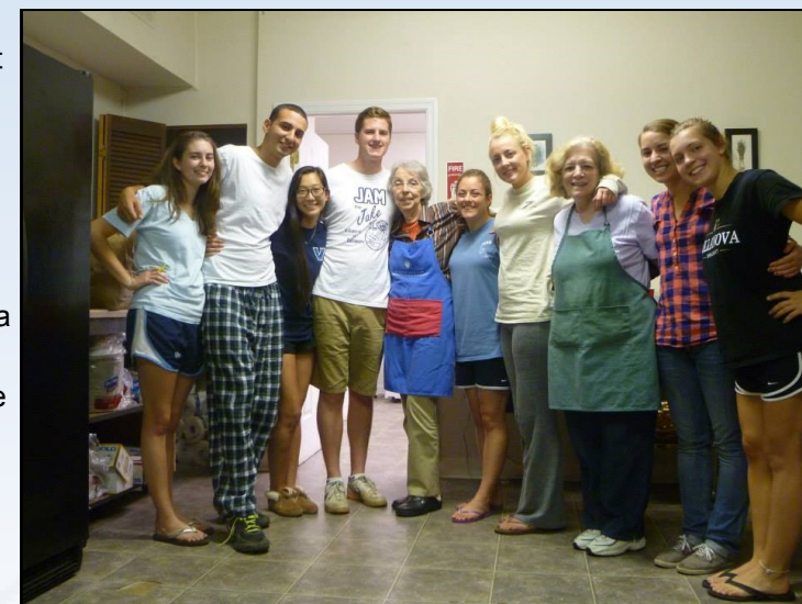
Volunteers and students from Villanova enjoyed food and fellowship in October.

The 25 th anniversary event will bring about 100 students from 10 schools to Winston-Salem, where they will start four