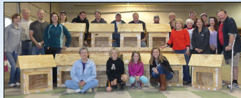
A group of volunteers built 13 “Little Free Library” boxes on Nov. 16.

The local project grew out of the national Little Free Library movement, which began in 2009 in Hudson, Wisconsin when Todd Bol built a box for his own front yard. The box was an instant success, so he erected several more in the neighborhood. By the end of 2011, the movement had grown to 400 Little Free Libraries across the U.S. In May 2012, Little Free Library was officially established as a non-profit corporation. It is estimated that the total number of registered Little Free Libraries in the