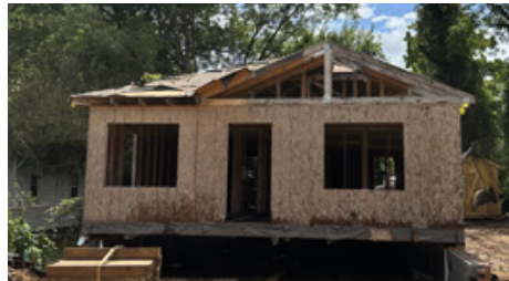
ON THE FOUNDATION