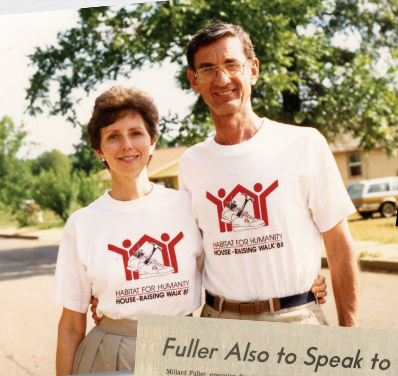
Linda and Millard Fuller